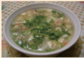
海皇一品豆腐羹 Seafood Bean Curd Soup