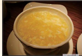
雞肉粟米羹 Chicken & Sweet Corn Soup