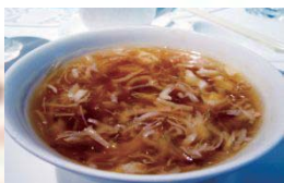
紅燒雞絲翅 Shark's Fin & Chicken Meat Soup