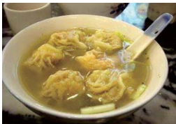
上湯雲吞 Short Soup