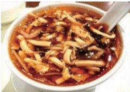
京式酸辣湯 Hot & Sour Soup Peking Style