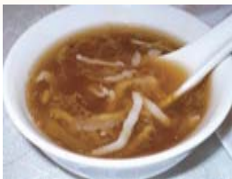
瑤柱魚肚羹 Dried Scallops with Fish Maw Soup